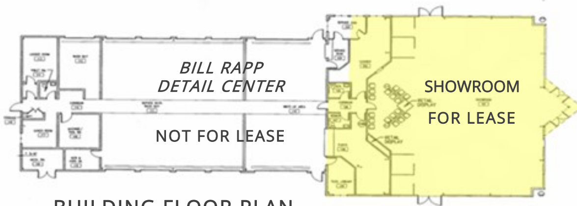
BUILDING FLOOR PLAN