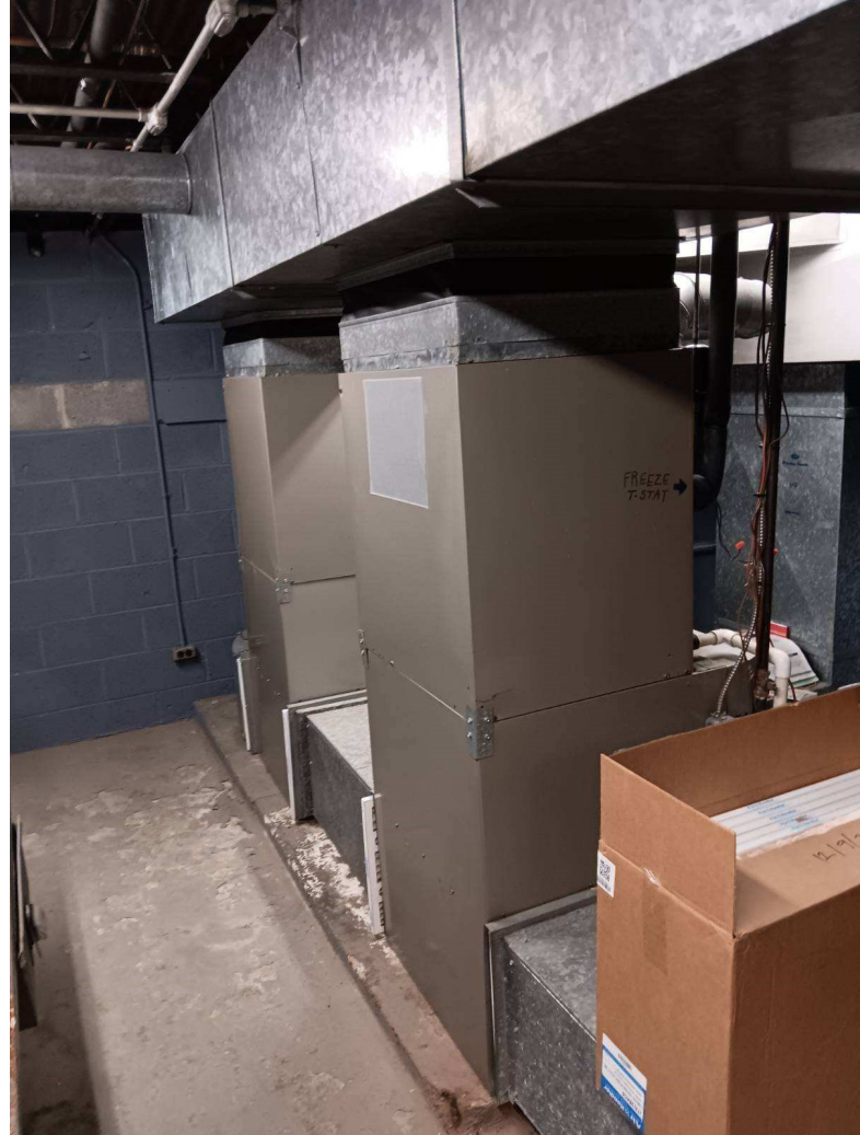
Mechanicals in Good Shape