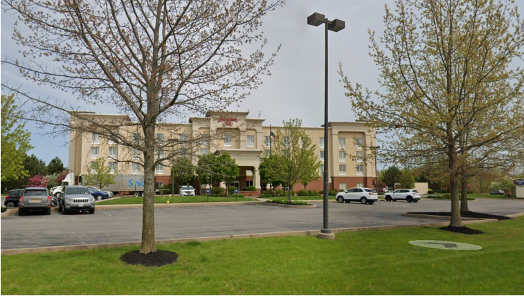
Hampton Inn Hotel