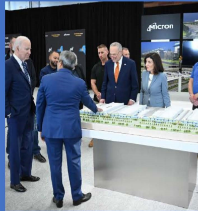
President Biden – Micron Announcement October 2022