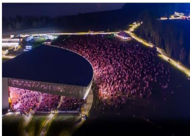
St Joseph's Health Amphitheater