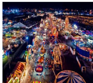
The New York State Fairgrounds