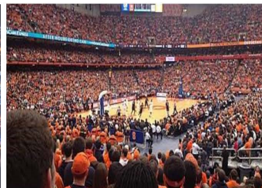
Syracuse University JMA Wireless Dome