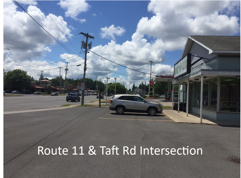
Route 11 & Taft Rd Intersection