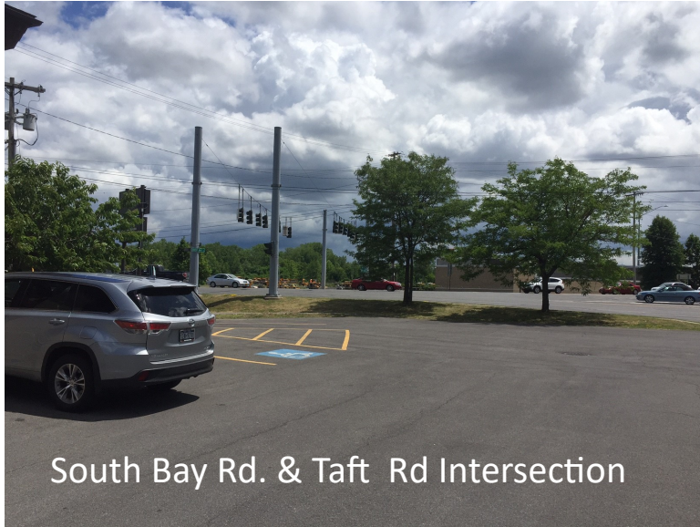
South Bay Rd. & Taft Rd Intersection

111-113 Taft Road, North Syracuse, NY 13212